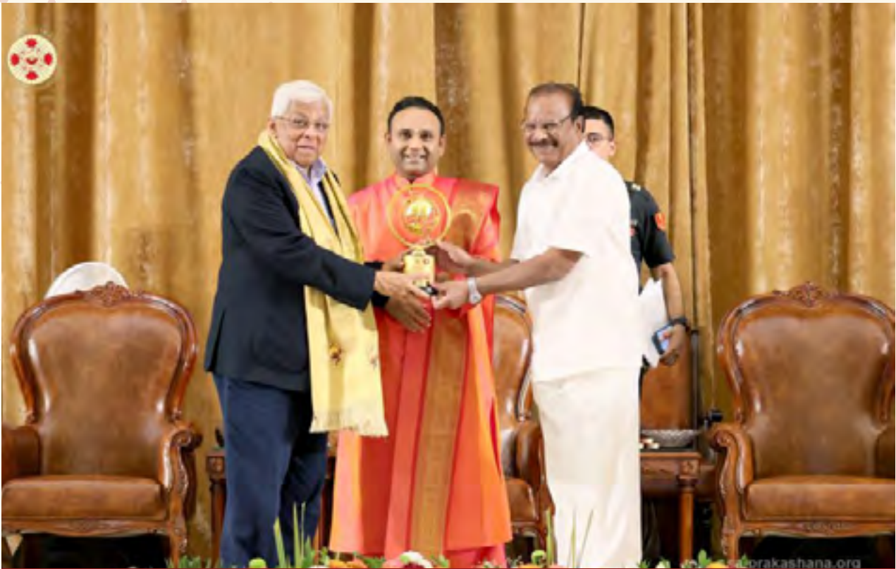
Mr Deepak Parekh, former Chairman of HDFC, Also present is Shri N Indrasena Reddy, Governor of Tripura