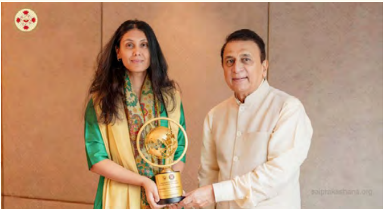
Legendary Cricketer Shri Sunil Gavaskar honours Shri Shiv Nadar, Founder of HCL and the Shiv Nadar Foundation (Mrs Roshni Nadar Malhotra, Chairperson of HCL Tech, accepting the award on behalf)