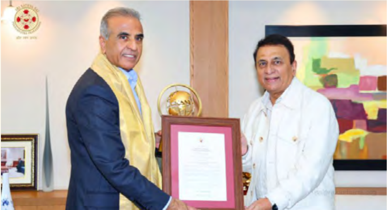
Legendary Cricketer Shri Sunil Gavaskar honours Shri Sunil Bharti Mittal, Founder and Chairman, Bharti Enterprises