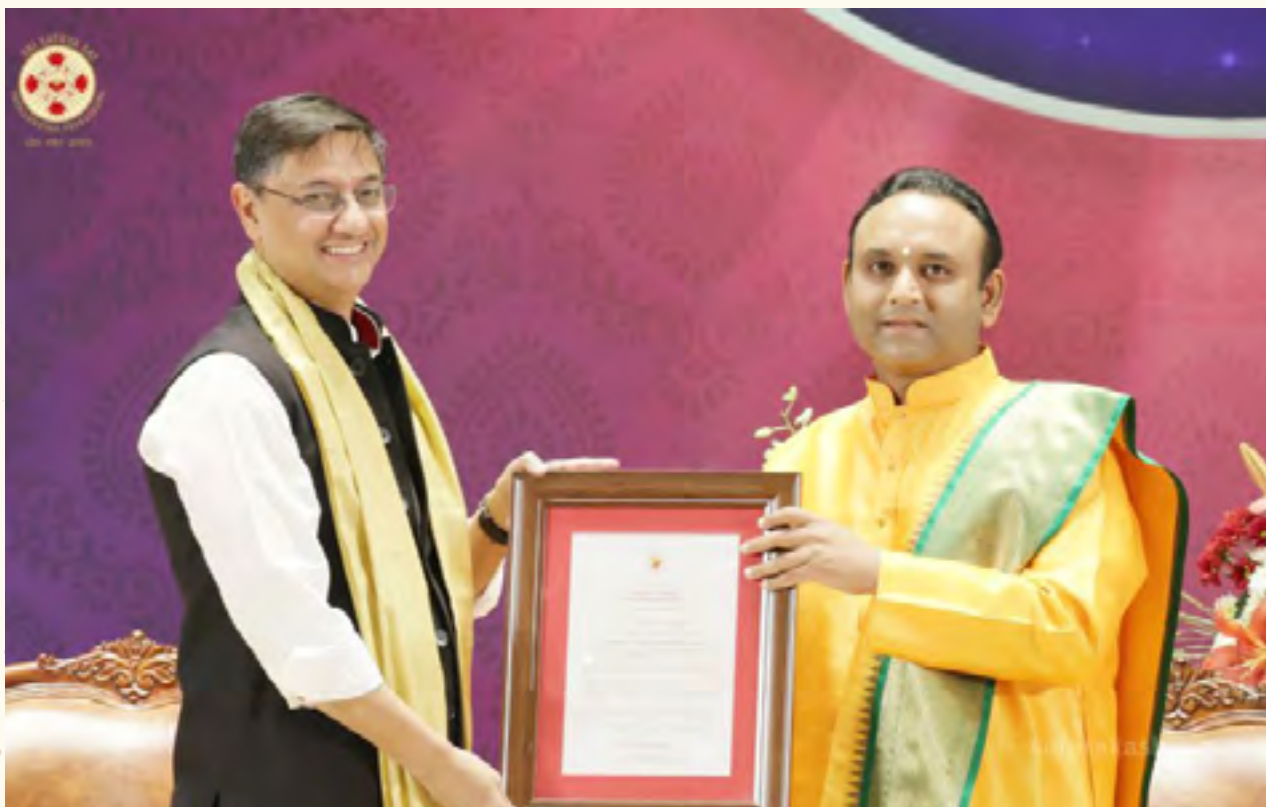
Mr Sanjeev Sanyal, Member of the Economic Advisory Council to the Prime Minister of India