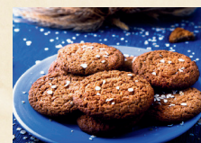
Cookies or Other Nutritious Snacks