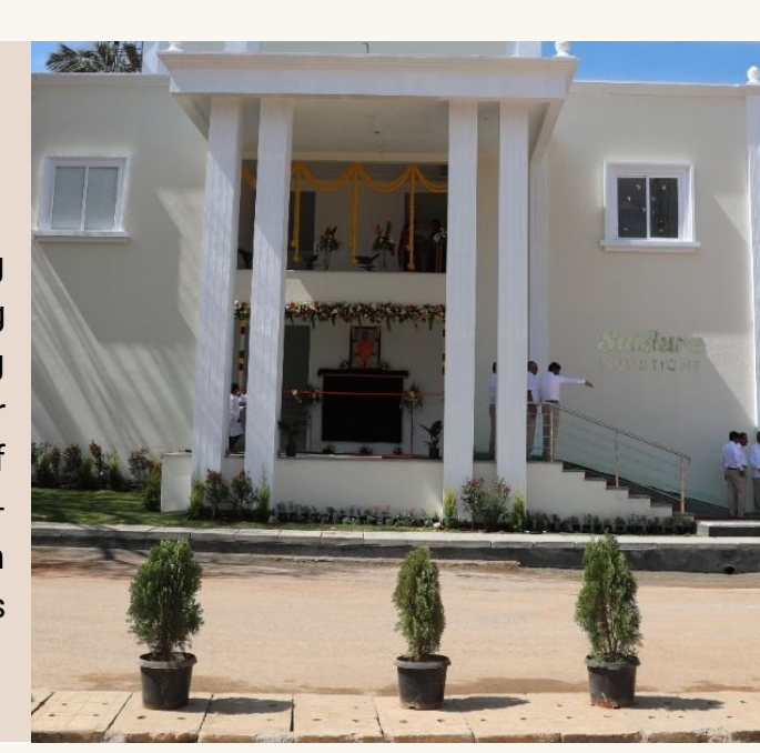
Visit our Website: https://annapoorna.org.in

My first visit to Sri Satya Sai Ashram in January 2021 changed my perspective after going around and seeing the vast campus with multiple activities encompassing education institutions with 1500 children, all in boarding facilities from 6th to 12th standard, functional hospital for Pediatric congenital heart surgery, and distribution of breakfast and Health Nutrition supplement – all free-of-cost. I felt it was some divine blessing that I have been identified for being part of this great mission of selfless love and service. The resolve became stronger.